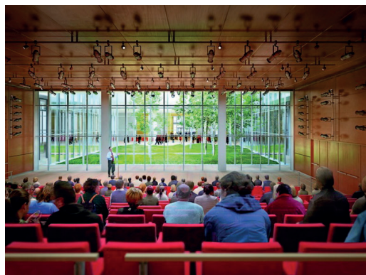
EXCITING CONFERENCE FACILITIES

Quantum Innovation Park will feature the most intelligent systems offered by modern technology, the environmental-friendly features of our sustainable age and the high security required by modern working and living environments.