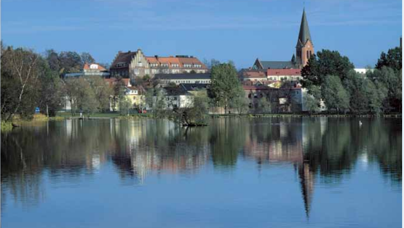
Nässjö- In the Heart of Scandinavia. Photograph of Nässjö Town Centre.

Nässjö – A Pleasant and Open Community with Everything in Convenient Proximity